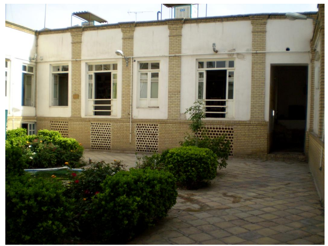
A courtyard house that once belonged to Imam Khomeini in Qom, Iran.