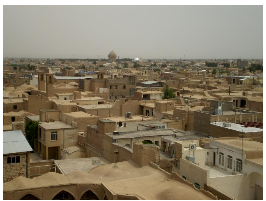
Residential areas in Kashan, Iran.