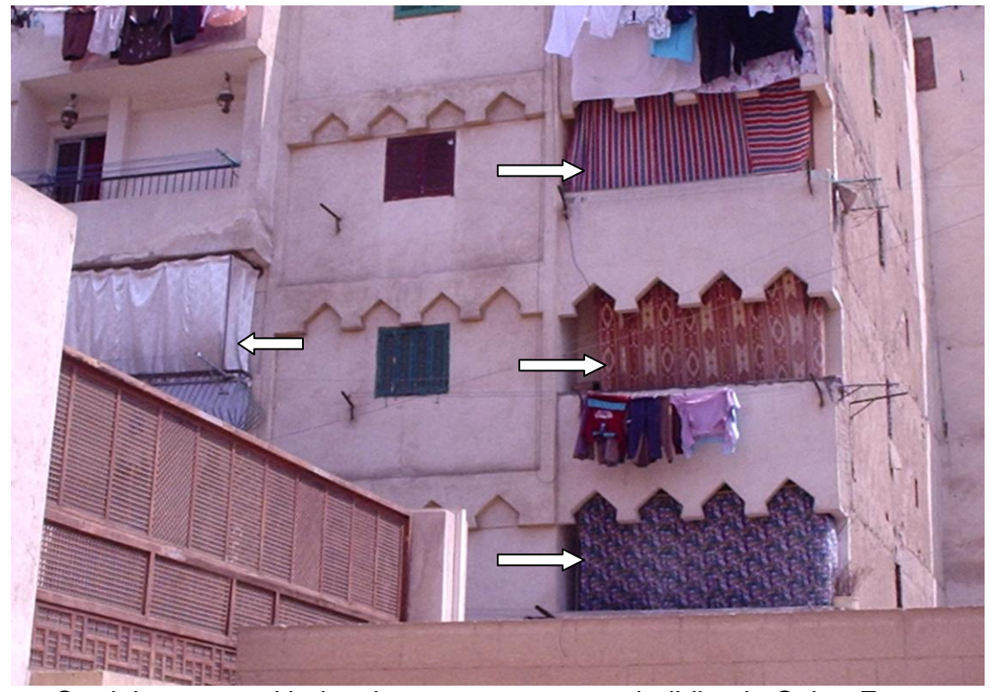
Crudely screened balconies on an apartment building in Cairo, Egypt.