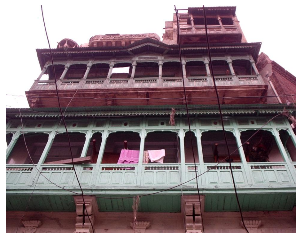
A traditional house in Lahore, Pakistan.