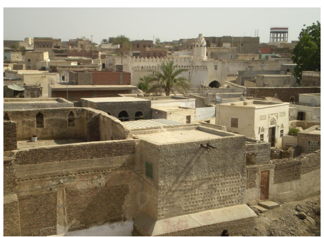
A residential area in Zabid, Yemen.