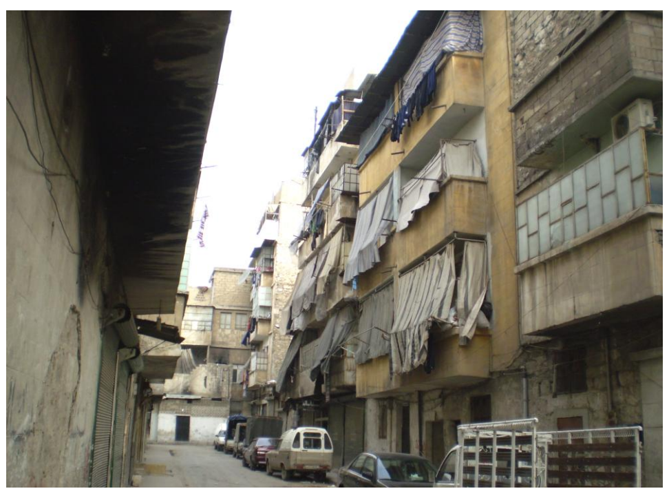
Crudely screened balconies on an apartment building in Damascus, Syria. Obviously, the people embraced some utilitarian ends at the expense of the aesthetic ones.