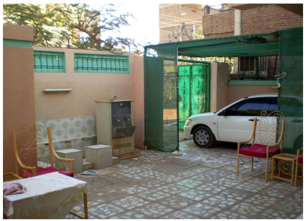
The courtyard of a house in Khartoum, Sudan.