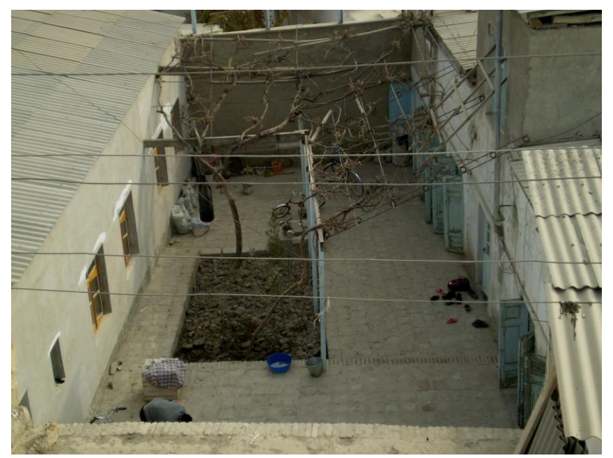
A courtyard house in Bukhara, Uzbekistan.