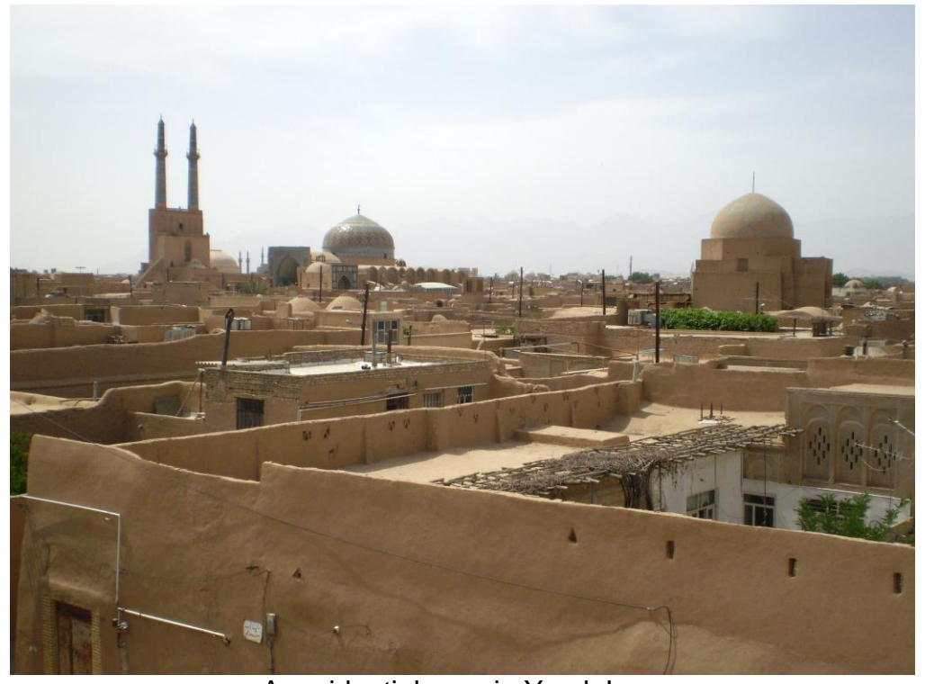
A residential area in Yazd, Iran.