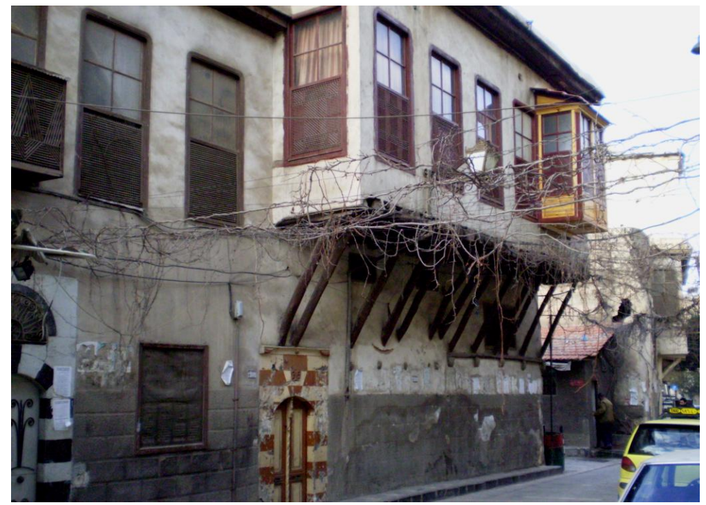
A house in Damascus, Syria.