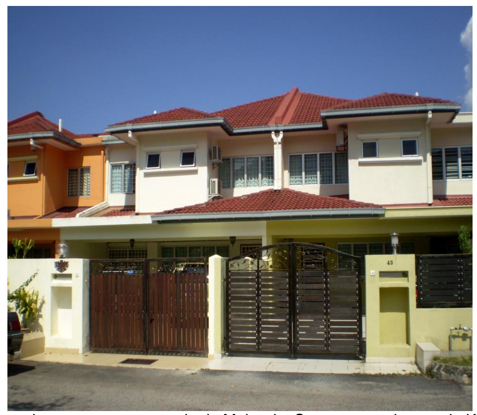
Terrace houses are very popular in Malaysia. Some terrace houses in Kuala Lumpur.