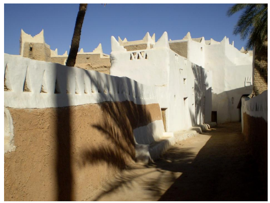
A residential area in Ghadamis, Libya.