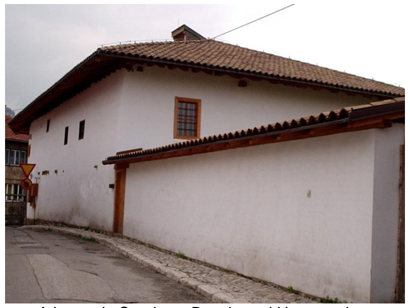
A house in Sarajevo, Bosnia and Herzegovina.