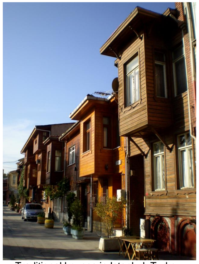
Traditional houses in Istanbul, Turkey.