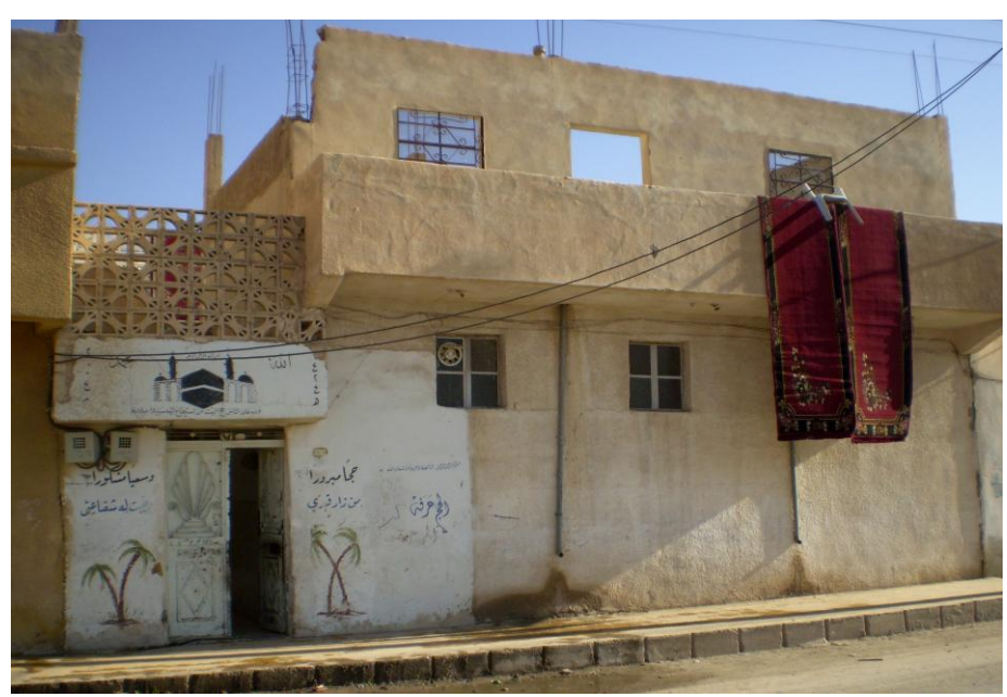
A house in Raqqa, Syria.

"Nay! We cast the truth against the falsehood, so that it breaks its head, and lo! it vanishes; and woe to you for what you describe." (al-Anbiya', 18)