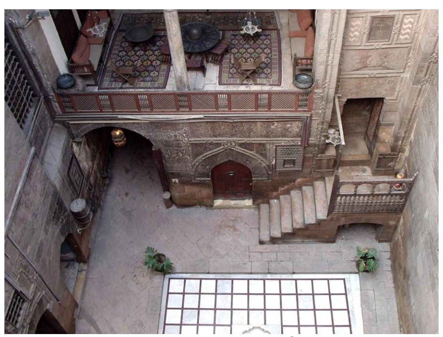
A traditional courtyard house in Cairo, Egypt.