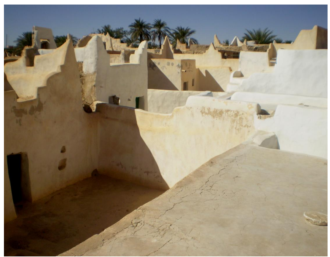
The roofs of traditional houses in Ghadamis, Libya.