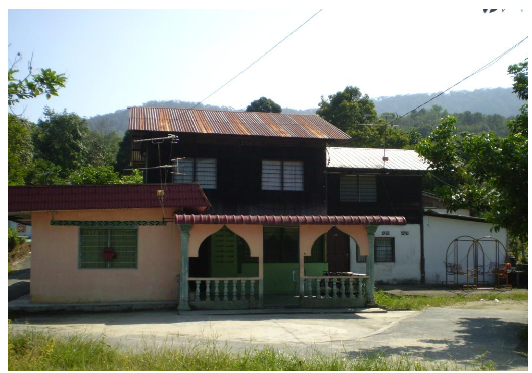
A house in Penang, Malaysia.