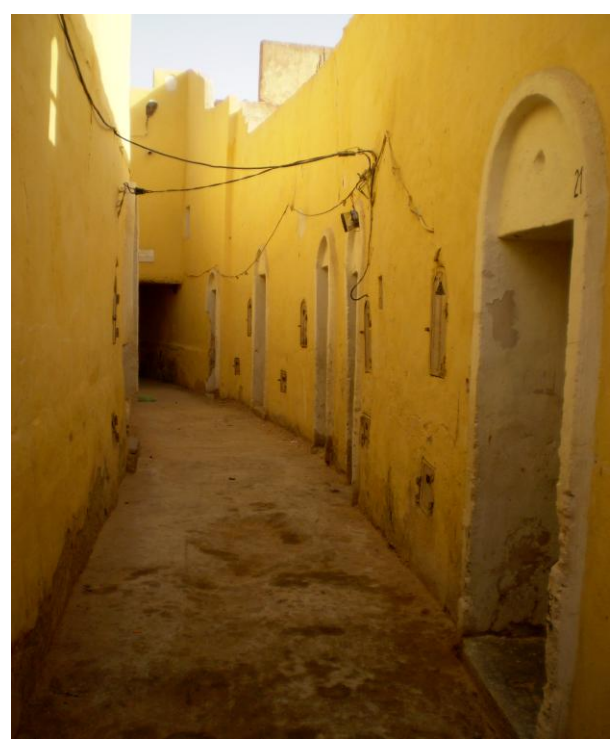
A cul-de-sac street in a residential area in Wirghlah, Algeria.