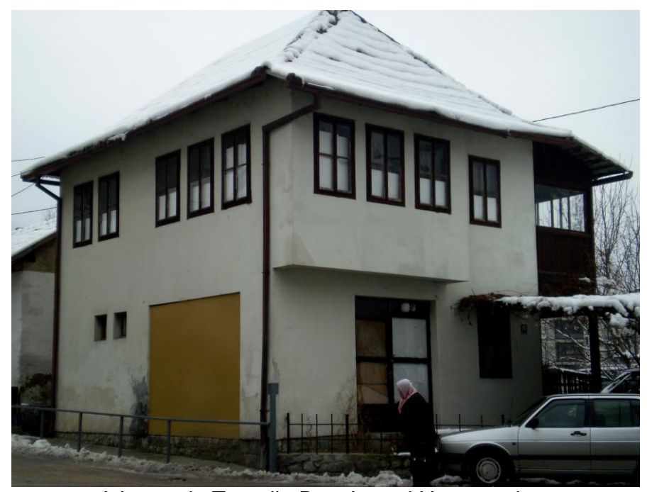
A house in Travnik, Bosnia and Herzegovina.