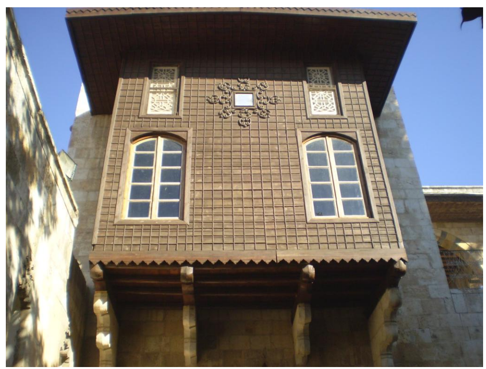
An enclosed wooden gallery on a traditional house in Hamma, Syria.