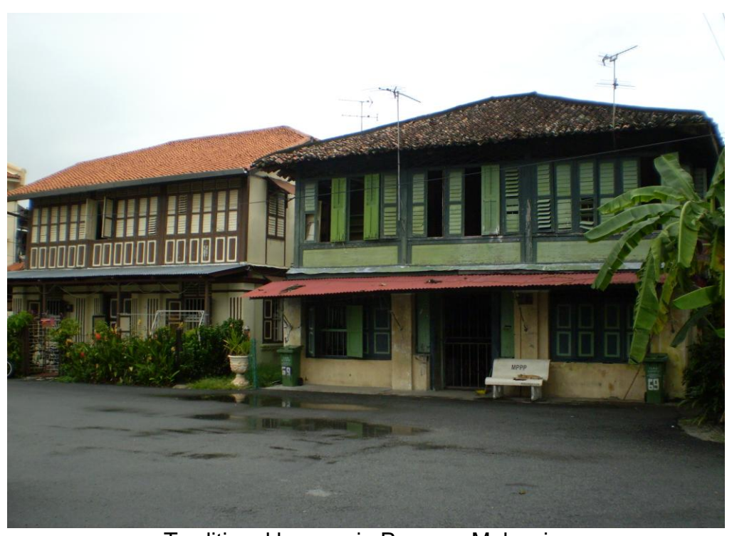
Traditional houses in Penang, Malaysia.