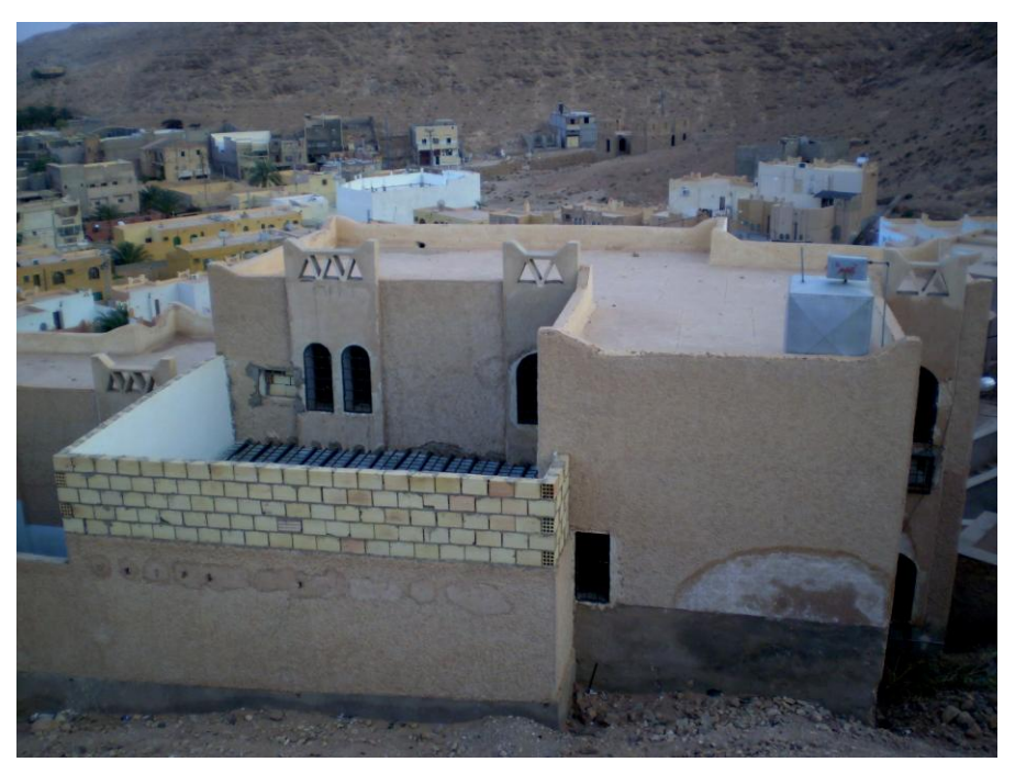
A house in Ghardaia, Algeria.